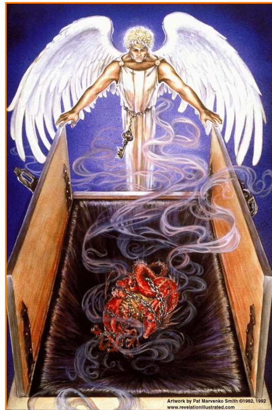
The Dragon Chained ( Revelation 20:3 )