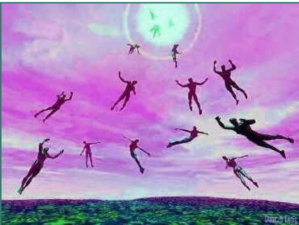
Rapture Over Land