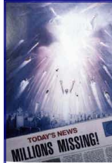
World in Chaos!