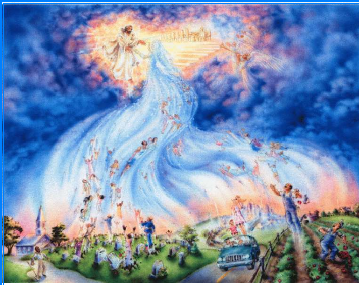
Rapture of the Church (Revelation 1:7)