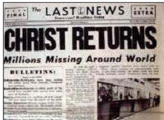
News continues to come in...