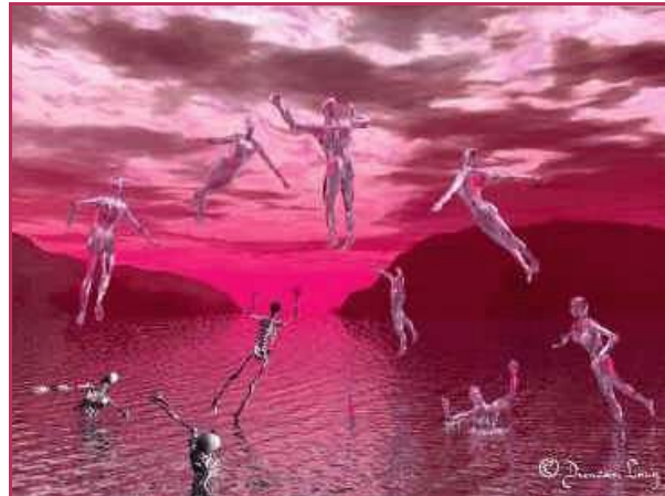
Rapture Over Sea