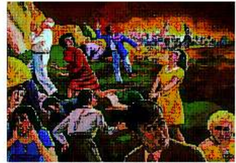
Complete wrath of God in seven plagues