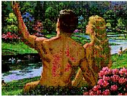
Complete creation in seven days