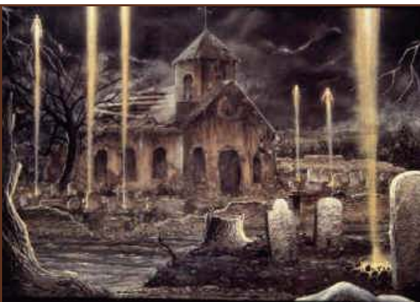
Rapture of the forgotten!