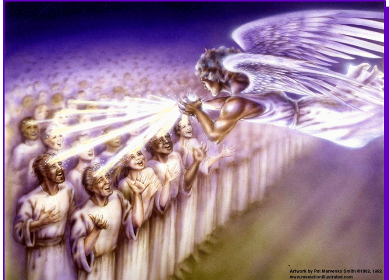
Receiving the Seal of God (Revelation 7:2-8)

B. The wicked get their seal—666—under the super-deceiver, the great imitator, the Antichrist ( Revelation 13:17-18 )